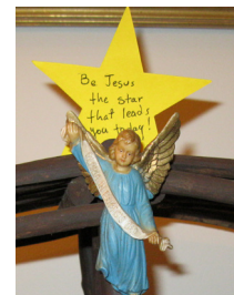
"Be Jesus the star that leads you today"