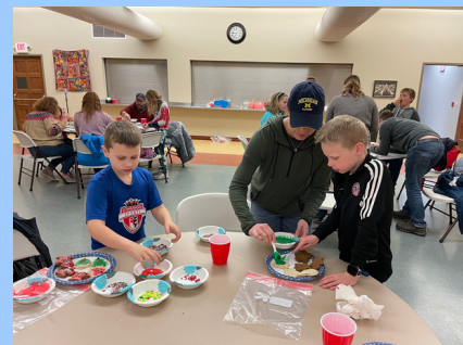
Chirstmas family fun event

We also want to give a warm thank you to all the families that came out to the Family Fun Night on Dec. 2nd. Events like this are only possible with your participation and energy.