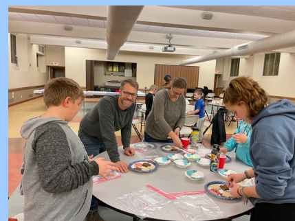
Chirstmas family fun event