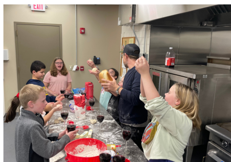
Disclaimer: its juice, not wine in the glasses