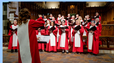
Easter Sunday choir

Articles for the next issue are due no later than May 6, 2023 . The next newsletter will be mailed the week of May 12 . Articles submitted to the newsletter should be sent to jcelorio@umc-kzo.org . Articles may be edited for space and content.