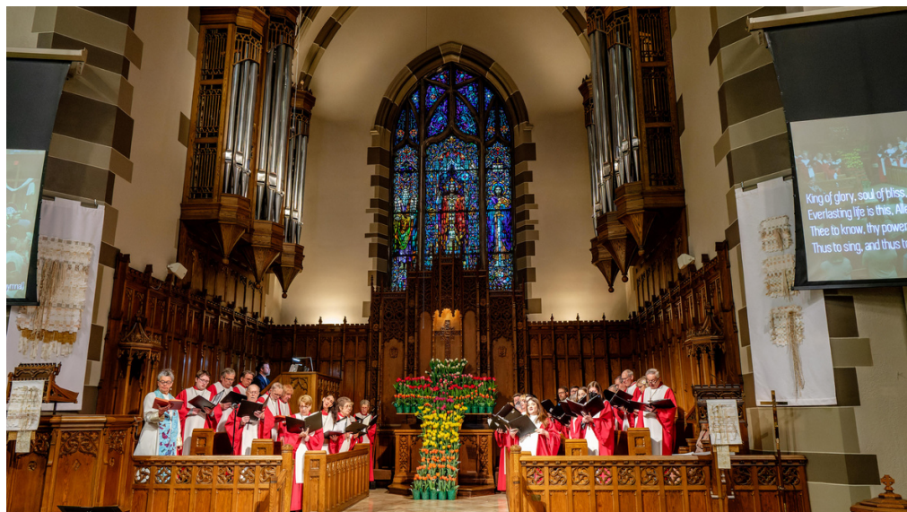
Easter Sunday choir