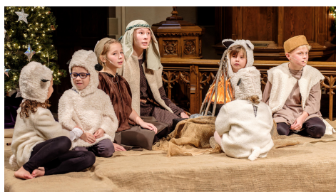
Christmas Pageant