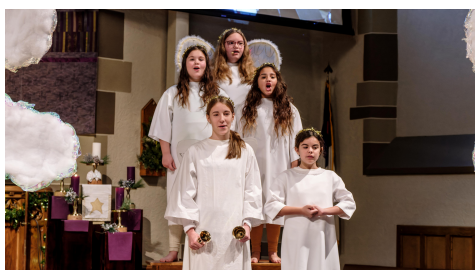
Christmas Pageant